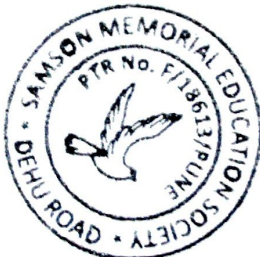
Nelson N Telgu - Primary