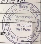
Shri Vighnagar Trust's Late Prof. Ramkrushna More English Medium School, Nivruttnagar Academic Year 2023-24 (Fee Structure)

Considering academic progress of the students, all the members decided to start extra classes.